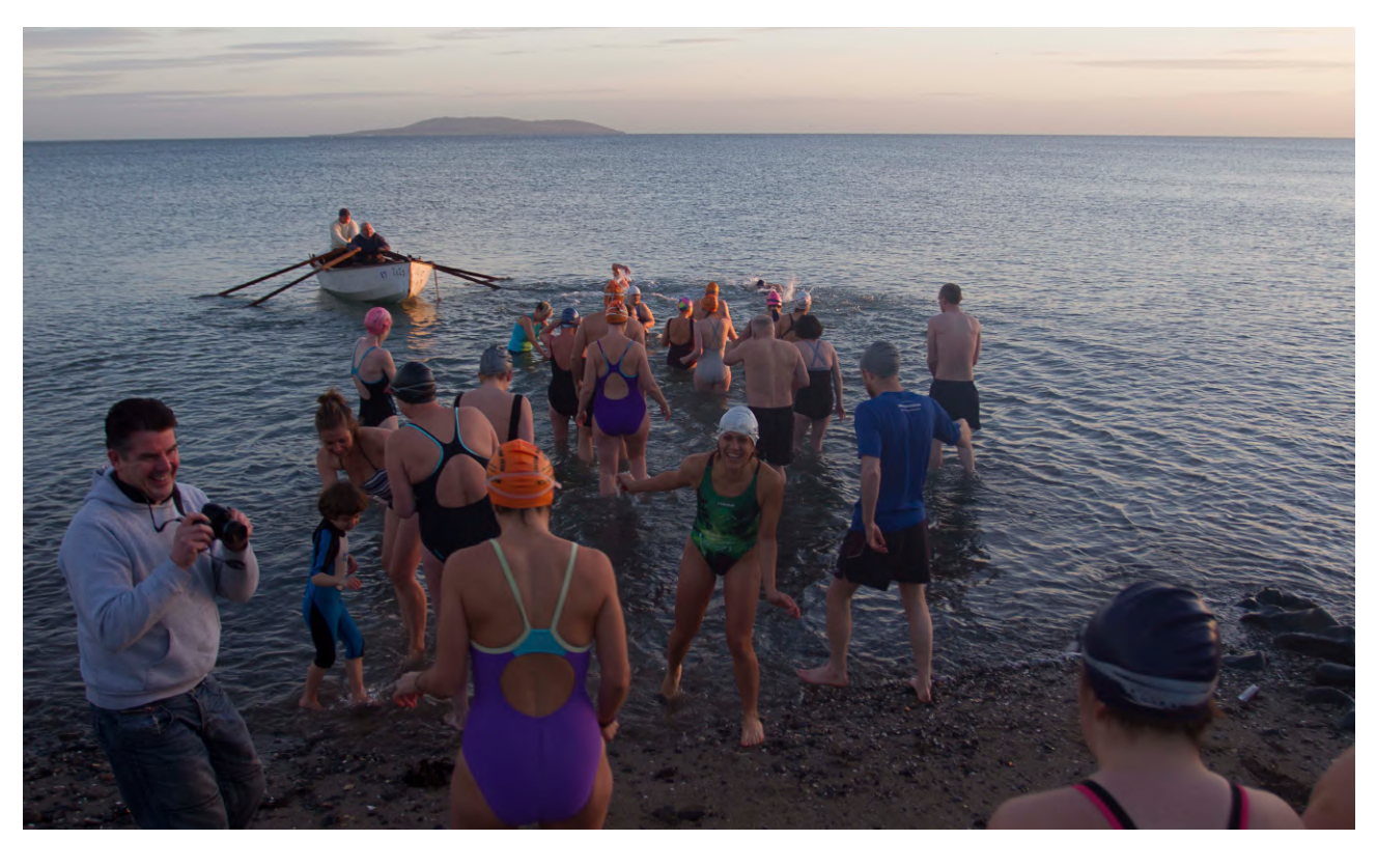
Image: "Uncharted" live art event December 2014 -invitation to swim at dawn, with Lambay Island in the background.